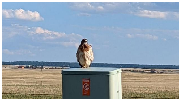
Swainson's Hawk checking out the action