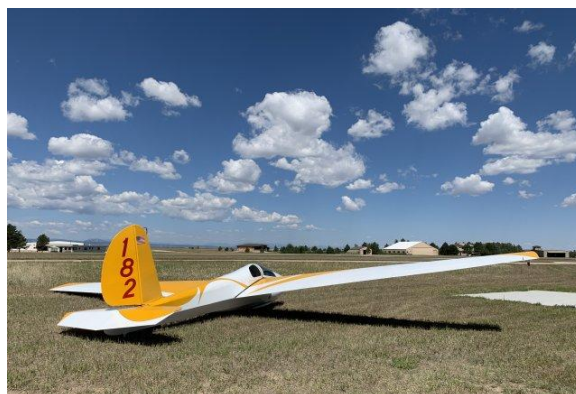
Sunbird ready to take on the Racetrack

So my first crack at the Racetrack in Sunbird netted me a whopping 40.5 knots over a 31.5 statute mile course and a handicapped speed of 66.9 knots. No records or anything, but a fairly satisfying flight. You can follow the flight here . The 1-26 may not be a "glass slipper," but it's perfect for some enjoyable, fun Sunday flying!