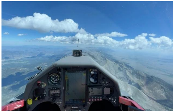
Southbound near Salida.