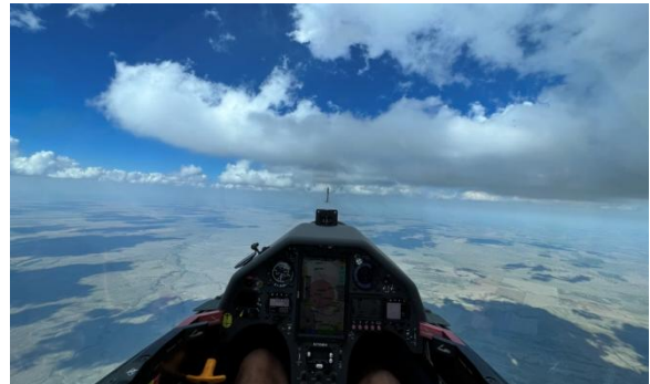
Bif Huss running a convergence line into NE Colorado. 8/12/22