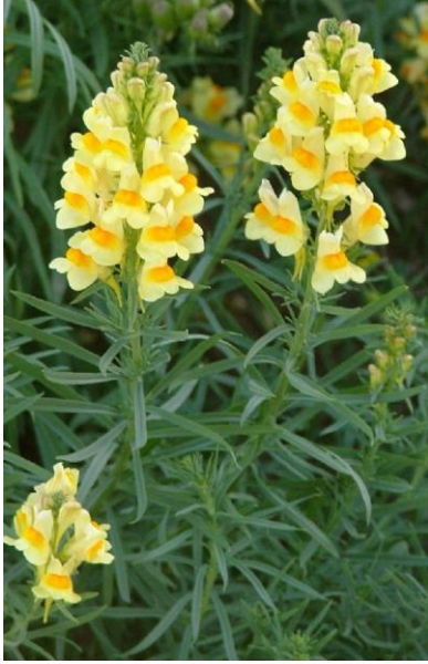
Yellow toadflax

Please help us eradicate these weeds. If you pull them, please be sure and bag them to prevent the seeds from scattering. Don't just pull them and leave them on the ground.