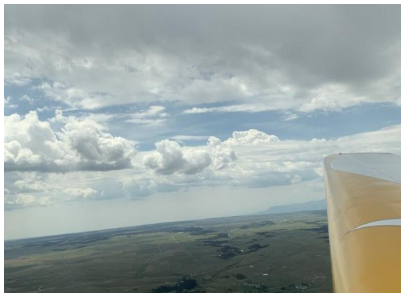
A nice afternoon with a 1-26