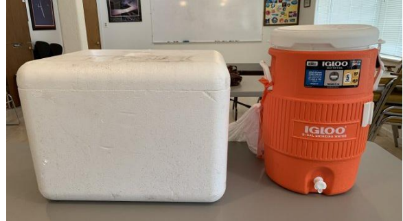
We now have two hydration options for the runway ends. On the left, the Kinders supplied a nice foam ice chest. Cooling packs are in the freezer. On the right, Gary Baker supplied a water jug for that last gulp before takeoff. GODs, please deploy these on hot days!