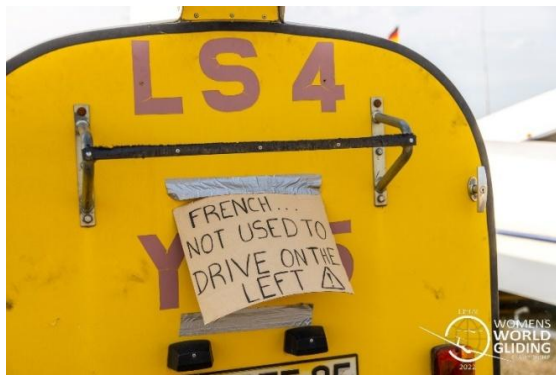
Seen at the Women's World Gliding Championships at Husband Bosworth, UK