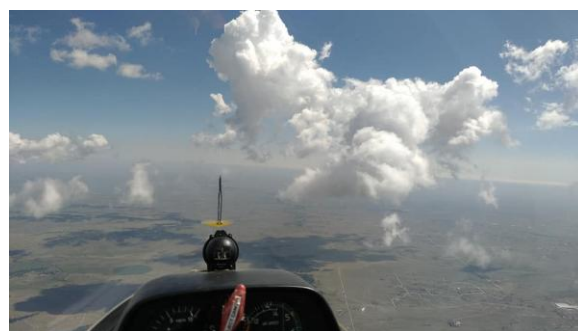
Vitaliy works the convergence line south of KAP on August 31. This was a pending badge flight for Vitaliy—more to follow in the October Airworthy!