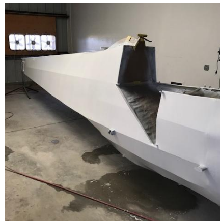
White Tanker!

Then came the first white color coat. It's starting to look like our old Tanker once again!