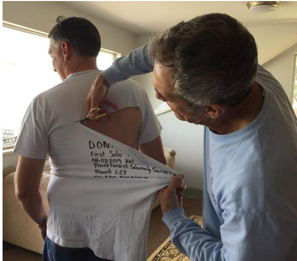
...and he loses his shirt!