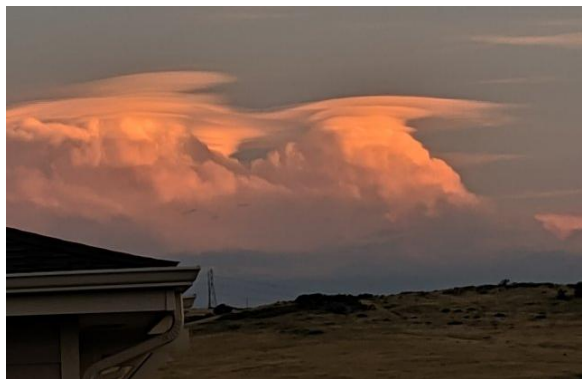
Frank DeBacker captured this image of a pileus cloud looking south from Highlands Ranch, 8/5/19. (Pileus is the Latin word for felt hat.)

The Downhill Dash is only a few days away (September 7 th and 14 th ) but the planning is coming together. We have a small, but enthusiastic group ready to strike out and land—somewhere. There's been great support by the club members not flying and we have plenty of ground crew to go around. If you'd still like to volunteer to crew, contact me and we'll get you on a crew. If you'd like to fly, let me know. You can always show up at the last minute (as long as you have a crew!).