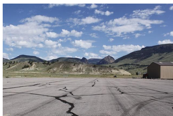
Mineral County Airport, Creede CO A possible club camp destination?