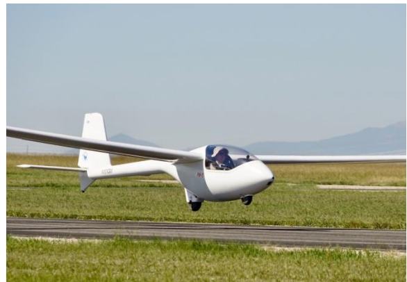
Zach Paluch greases his first PW-5 landing.