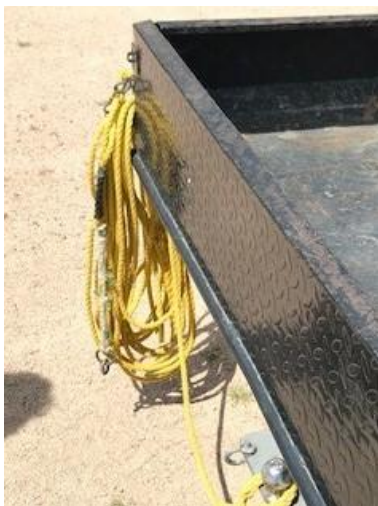
Not this way...

In one of the two photos, the rope is simply coiled; this technique screams, "Let's make another knot." In the other photo, the rope's end is tossed into the cart; this is wonderful as it helps avoid making a knot the next time the rope is pulled out.