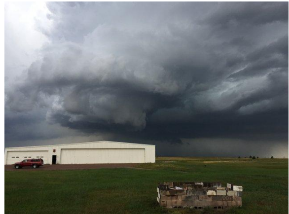
Batten down the hatches! Late afternoon, August 1 st