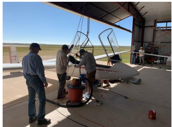
The village strongmen and the village smithy work on the ASK-21 annual.