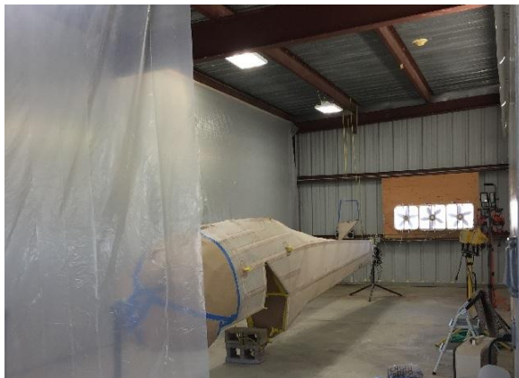
Heat smoothed, cleaned, masked, and ready for spraying

After this huge effort, it was ready for Doug Curry to apply the PolyBrush and PolySpray (silver UV protective) spray coats.