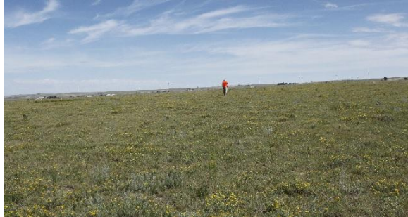
Tranquila, looking north

as well as powerlines on the south. The runway appears to undulate a little with a low spot in the middle. Good news—there’s an open gate on the south side.