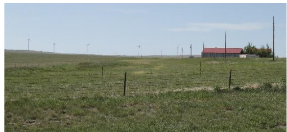
Flying Cloud east of Simla, looking south

One main destination was a field just east of Simla, as the highway curves back northeastward. Called Flying Cloud by Raul, this north-south runway looks landable. Raul can share a few more details since he has "dropped in" on the residents on at least one location. Look for the powerlines north and west of the field and a fence on the east side, with hangar and windsock on west side. This site is a possible stepping stone runway between Calhan to the southwest and Limon to the northeast of this field.