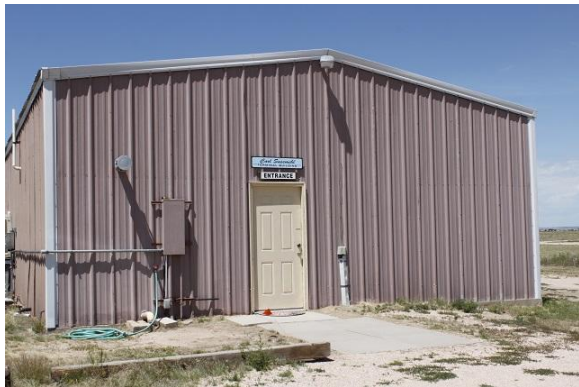
Colorado Springs East terminal building

An even better landing option is Colorado Springs East Airport , shown on the sectional. This has a long 17/35 paved runway and 08/26 gravel runway, as well as plenty of long taxiways should you need them in a pinch. There’s even a nice little unattended terminal with snacks and a bathroom! Don’t expect a lot of company there (talk to Bif Huss about his unplanned visit there earlier this summer) but it looks like a great option.