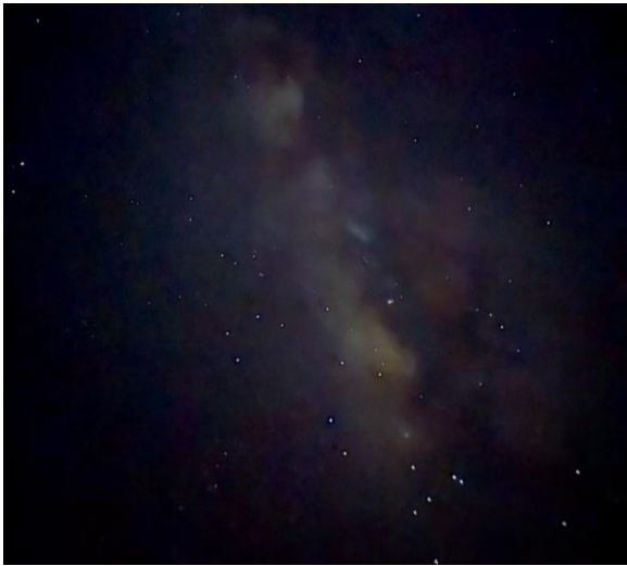
View of the Milky Way from Moriarty