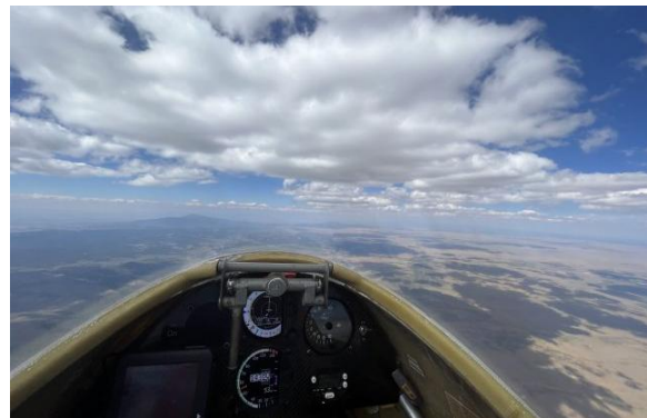
Moriarty cloud streets.