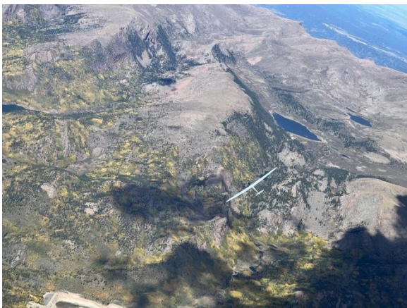
Bif Huss captures Dave Leonard in flight enjoying the fall colors 9/30/23