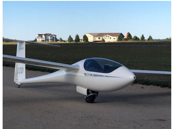
D2D at rest.