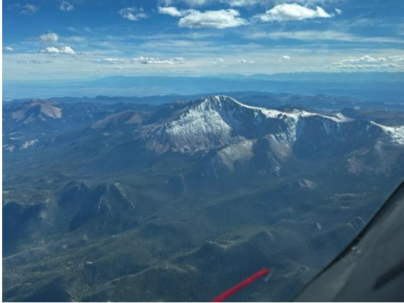
Pikes Peak with a dusting of snow. 9/17/23