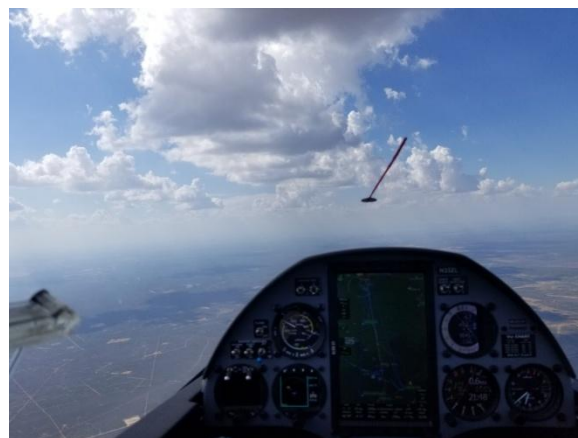
Typical Uvalde day

The first leg was quite soft, but with lots of gliders to help find lift, all but one made it to the cu in the first turn area some 60 miles from the start. Then it was hammer time, which the new JS3 loves (and I do, too).