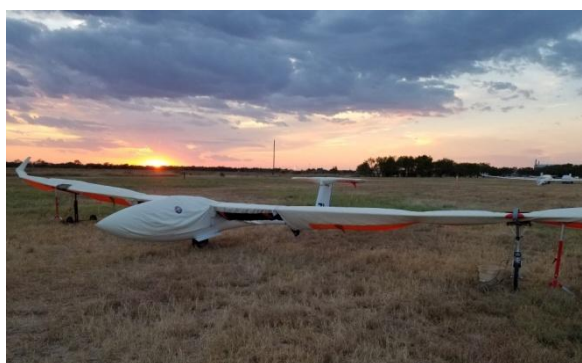
ZL bedded down for the night.

None of this was unexpected based on the forecast, and the task was well designed to exploit the good area and provide a suitable challenge for a national-level competition. Most of the pilots were sucked into the blue day trap of no-no, after you, ah please, after you, OK thank you, oops I forgot to adjust my relief system, be right back, but you go on ahead, etc. A few went out early and mostly paid the price as the later starters caught them early on. I had waited nearby watching the action and ended up leaving on course just at the back of the big wad of late-starting gliders.