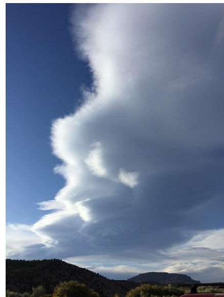
Wave over Western Colorado