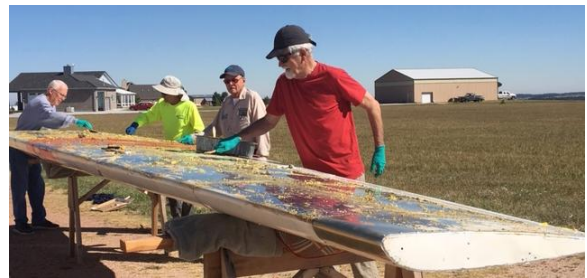
The 840 Team tackles the tough jobs.