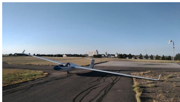
Fox Delta at Flagler, CO

It is a different kind of flying when you aren't planning to come back to the airport you took off from. It is also nice to know your crew is following you and isn't too far behind. Thanks, Vitaliy! It was a fun flight.