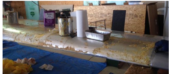
Messy job.