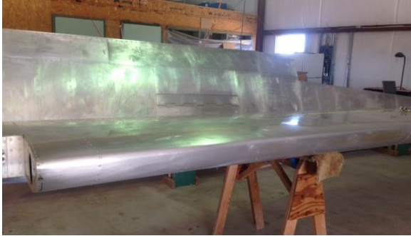
Clean and ready for the next step.

Just a bit of cleanup is needed before the wings are ready for Doug to begin installing the additional inspection holes required by the higher gross weight mod. This task, along with final fuselage paint coats, will need to be worked into Doug's busy project schedule. The volunteers remain ready to assist as needed.