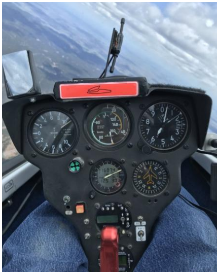
Clay Thomas on May 4, 2019, near Woodland Park. Notice 12.5 knots on averager.