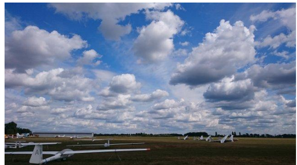
Cloud streets to the horizon! Buzovaya, Ukraine