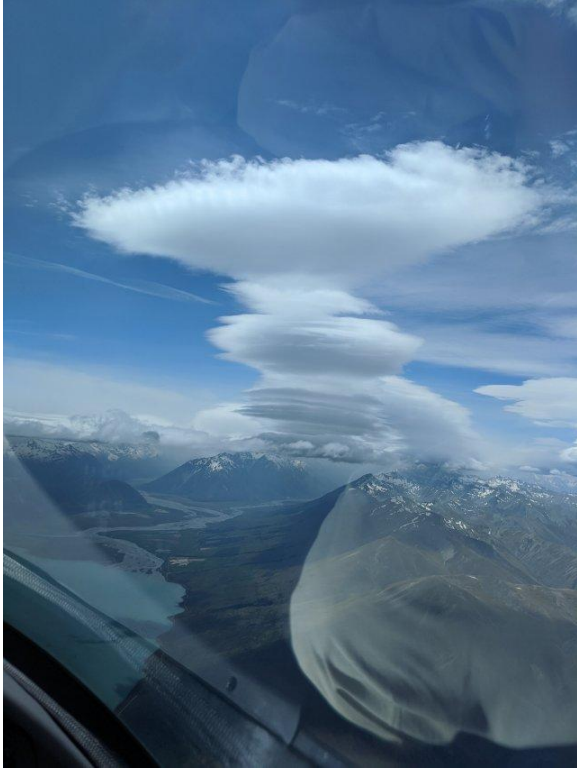
Out-of-state member Kevin Shaw took this photo of the wave over Mt. Cook in New Zealand last November. Says Kevin, "This shot is early in the day on the milk run up to Mt. Cook. By the time we got up that way, it was VFR on top with a solid cloud deck at ~15K and we were at ~20K+. (As everyone reading this probably knows, the Omarama folks will tell you that the area around Mt. Cook is the only place in the world where the airspace is always Class G from the ground to the stars.)"