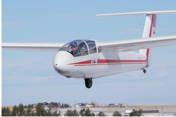
Alan Luke's favorite glider photo—son Roen soloing in December 2019