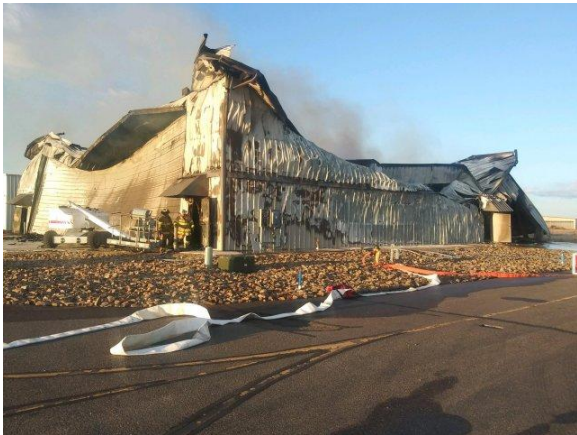
Big hangar fire at Moriarty in late March. It does not appear any gliders were involved.