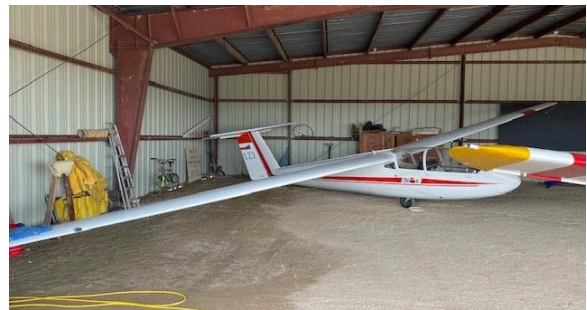
BA is ready to rock and roll.