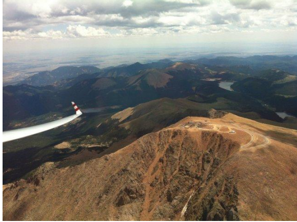
Stan and Steve over Pikes Peak in the ASH-25, 6/3/2012