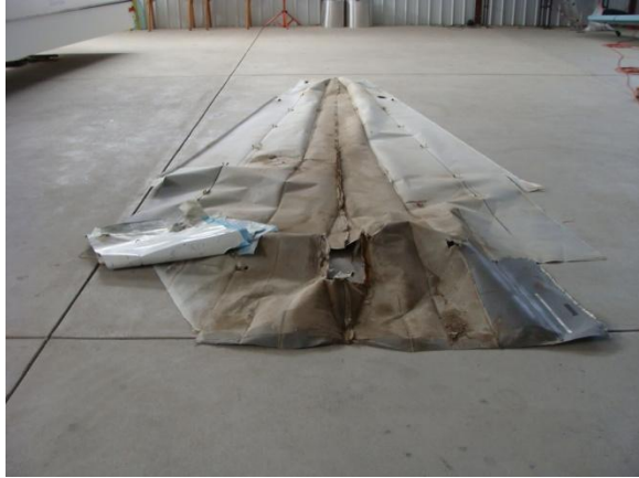
840 sheds its skin

Disassembly, welding, and some initial work took place at Doug's hangar—thank you for the space and use of your tools Doug!