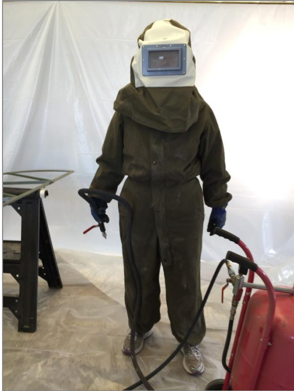
The Aliens came to help