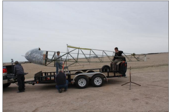
Getting ready for a short-distance transport

After some initial cleanup and sanding, we moved the fuselage into the BFSS third hangar shop area. Thanks, Gary, for the use of your trailer!