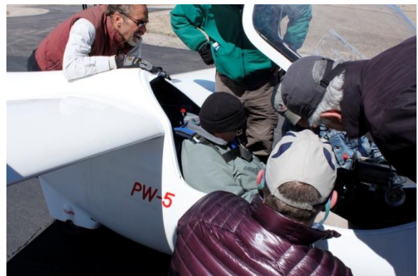
It takes a Village