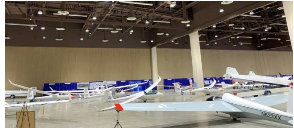
The Convention floor