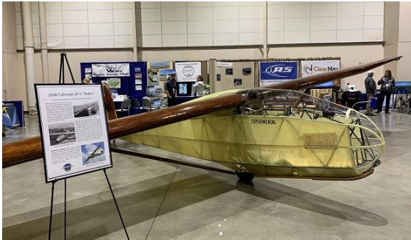
Restored 1938 Robinson JR-V "Robin"