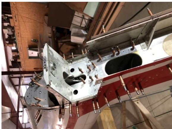
Fin repair work.