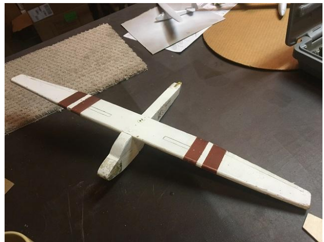
The tail-less 840 training aid

Mark has taken on the task of rescuing the little "840" training aid and fixing it. This little glider has been a training aid used by the Black Forest flight school for probably as long as 840 has been with us, more than 45 years. We do not know for sure who made it (although, our friend and Black Forest instructor from the old days, Stan McGrew is a likely possibility). We are looking forward to its refurbishment and use in the training program!