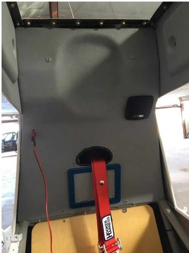
New rear speaker and the connector for the battery charger (charging cord hooked up in photo).

The electrical system tested OK, although there is a bit of a hum in the radio that needs further investigation when the ship is outside the hangar. There may be a few other adjustments needed, but things work!