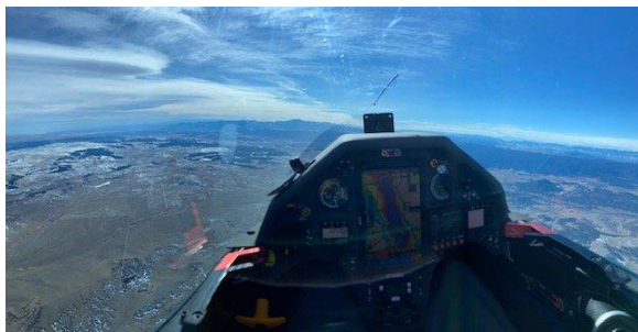
Bif in the wave, January 2021

I can see why the Black Forest Wave was world renowned back in the day. It's still here and I think it is accessible by club gliders from Kelly, maybe more often than we realize!