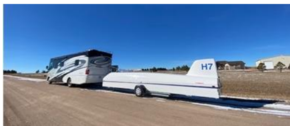
H7 leaves for the Seniors.