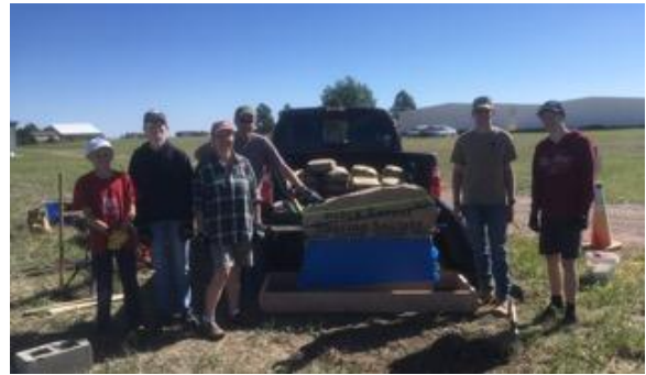
Some of the hard working contributors