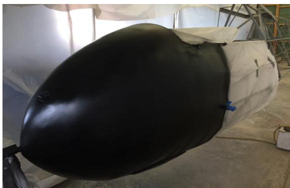
Nose cone with featherfill coat