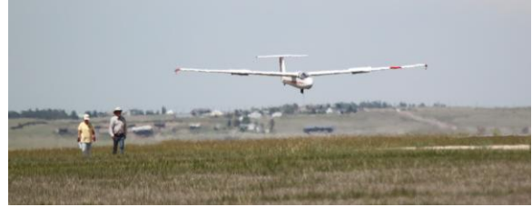
Julie Kinder lands the Blanik