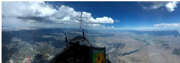
H7 (Bif Huss) southbound on the Wet Mountains 6/4/18