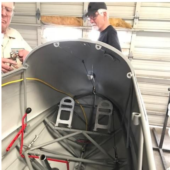
Nice light gray interior on the nose cone

Then began hours of work on final filling and sanding of the exterior of the nose cone. At the time of publication, the nose is all black—that's a featherfill coat that will be sanded off, leaving a smooth surface ready for primer.