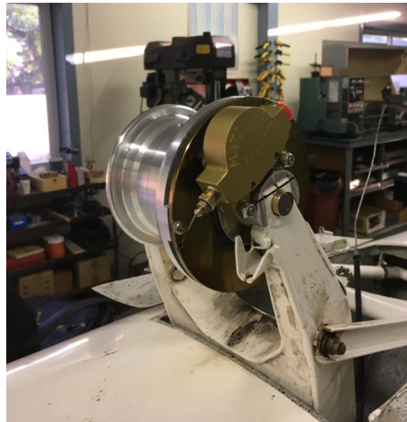
Shiny new parts installed with Dave Rolley's talent