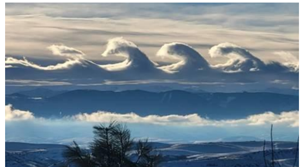
This has been making the rounds on the Internet lately: Kelvin-Helmholtz clouds in the Big Horn Mountains. 12/6/22. K-H clouds indicate severe turbulence