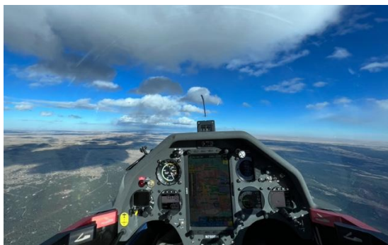
Bif running the Palmer Divide convergence line, 12-6-22