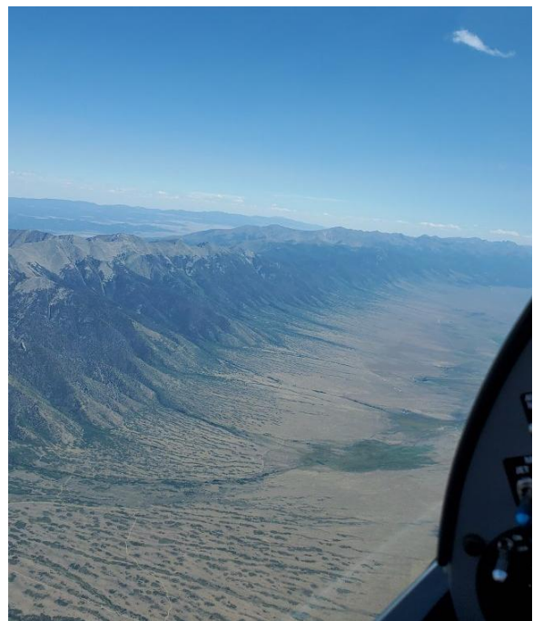
Clay Thomas southbound west of the Sangres, 8/22/21