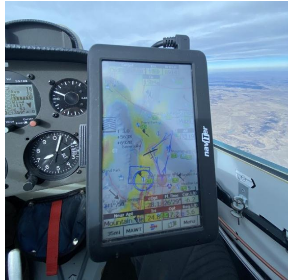
From the back seat of the Duo

Over Green Roof, we finally get some turbulence and some lift. We ask Dave to circle in it and pop off at 13K. I noticed the Oudie saying the wind was out of the northwest at 50 knots. It was smooth but not much lift. I do a wandering search pattern west and we get a gentle 4-knot climb. A few turns and we are at 14K. The wind was up, the Oudie snail trail showed very elongated circles. We connected. 7 knots up, zero turns needed, nose into the wind. Smooth as glass. We take the elevator up to 17,500 feet.