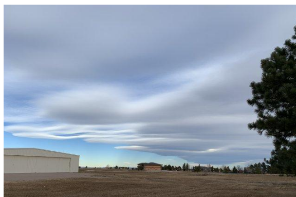
Early morning wave, 12/12/21

Everyone, line crew and towpilots, please review the club Launch Procedures . Don't get bit by the bullet.