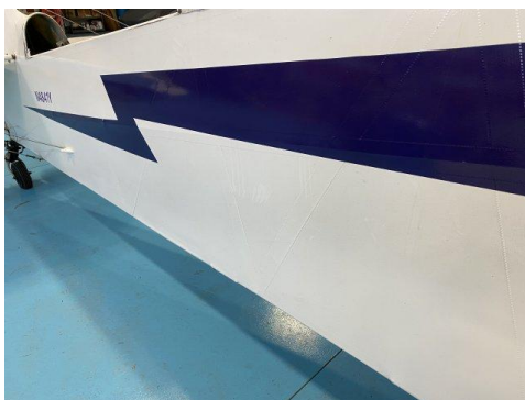
41Y has a removable turtle deck on its spine for access for inspections.

Satisfied with this, I put it back in the hangar and searched through the aircraft logbooks and 337 forms (documenting major repairs) in the logs. Nothing was surprising given its former life as a duster. The plane had been converted to a towplane at some point in the late '80s, which was even more encouraging, as towplanes are usually treated much better than crop dusters.