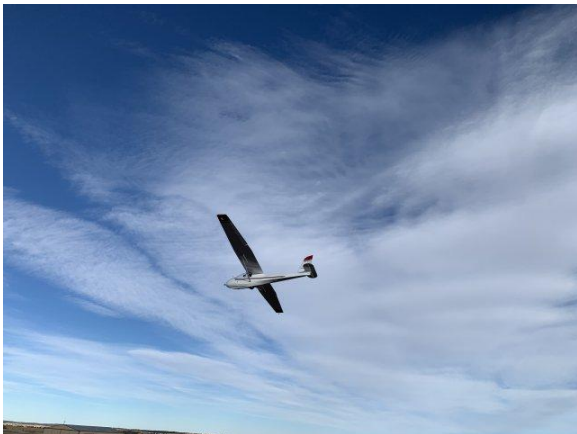
Quay Snyder and Vitaliy Aksyonov practice full-slip landings in 840.