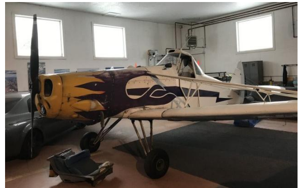
41Y awaits inspection.

As an A&P/IA I had a very clear order of things I wanted to look at on the aircraft. Item one was a general look over of the airplane. I inspected inside the fuselage and wings first, and was very pleased with what I saw. Unlike most crop dusters that spend their lives being beaten up and not cared for very well, someone had gone to the trouble of a fabric-off restoration of the frame and wings. Everything was nicely painted in zinc chromate to prevent rust. Although some of the hardware inside the wings showed indication of surface rust, which is normal, as a whole, it was a very nice airplane as far as corrosion issues are concerned. I noted no obvious oil leaks under the aircraft, or on the engine, and a fairly complete instrument panel.