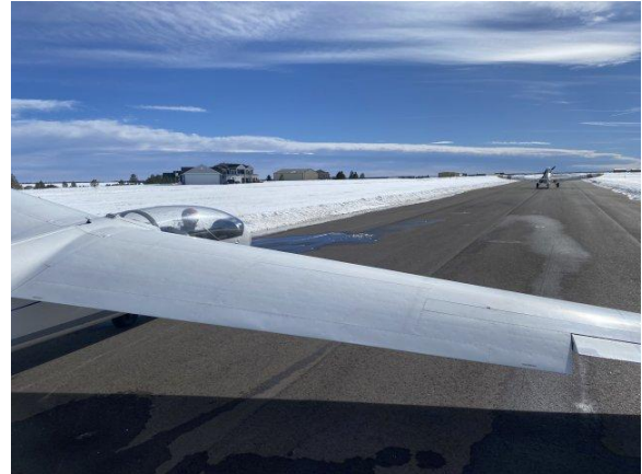
Icy Launch