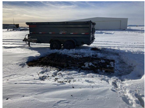
Final results of the fire pit cleanup project!

Doug Curry and Bill Gerblick – For continued work on hangar doors