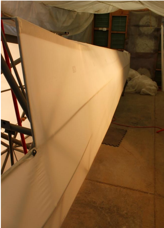
Left side fabric through initial shrinking

Our major focus right now continues to be gluing the fuselage fabric. The bottom and left side fabric are attached.