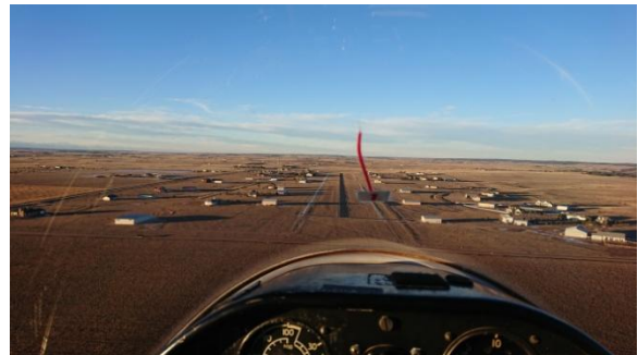
Vitaliy's friend Max took these pictures as Vitaliy flies the pattern.