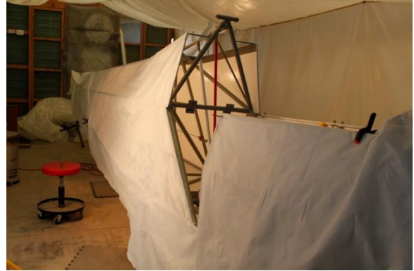
Right side fabric in progress

So far we've been pretty lucky with weather. We did lose one day due to cold this month. Our propane heater is working well. It keeps the area two feet above the fuselage very warm even though our feet stay cold! Oh, well, as glider pilots we're always glad warm air rises.