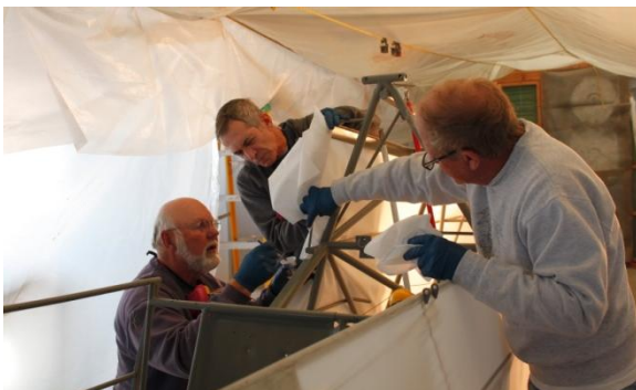
Working on the door frame

Work is nearly complete on the right side fabric. We've had some detail work to do on the door frame that takes extra time.