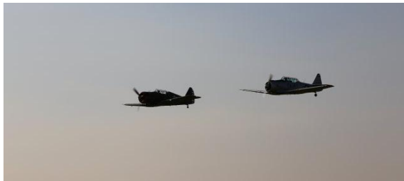
Pancake Patrol