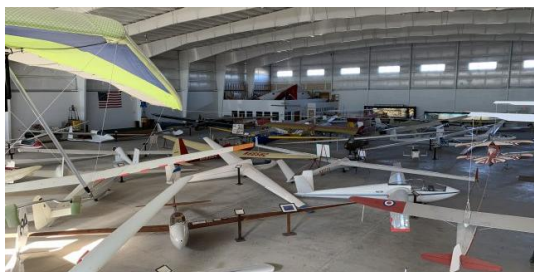
Southwest Soaring Museum, Moriarty, NM