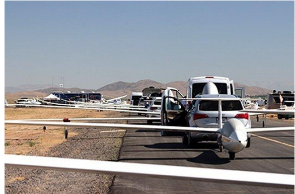
March to the grid