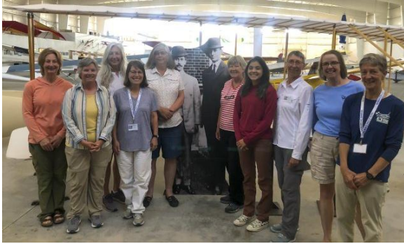
Womens Cross Country Soaring Camp participants.