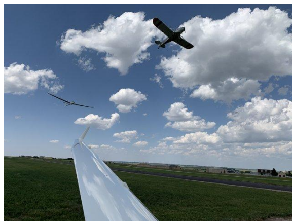
Kyle Kendall pulls Bif Huss in the Duo Discus with D2D's wing in the foreground