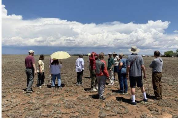
Airfield road trips are now a thing. Women's XC Camp members checking out a landing site known as "Otto" north of Moriarty.