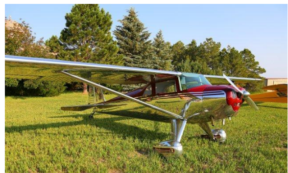
Gorgeous Luscombe.