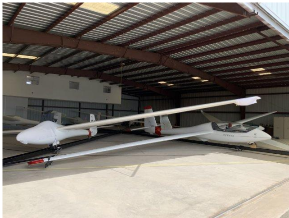
The famous Moriarty hangar carousel