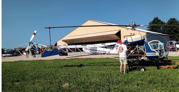
Many types of flying machines were displayed, including Jon Stark's Bell 47 helicopter.