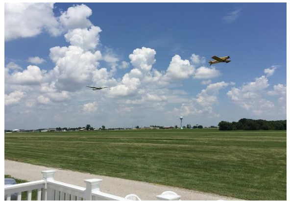
Highland-Winet Field, home of the St. Louis Soaring Association