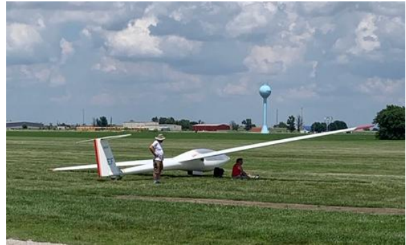
Enjoying some shade while waiting for tow

We had very hot and humid conditions, with the heat index near 100 every day we were there. We were grateful to SLSA for allowing us to keep our ship in the hangar so we didn't have to rig and derig each day.