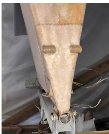
Gussets on the skid and tail

We feel we're on the home stretch if we can keep up the pace!