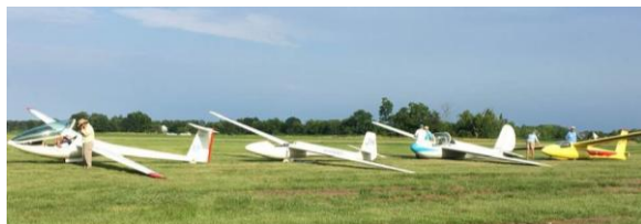
WSPA lineup.