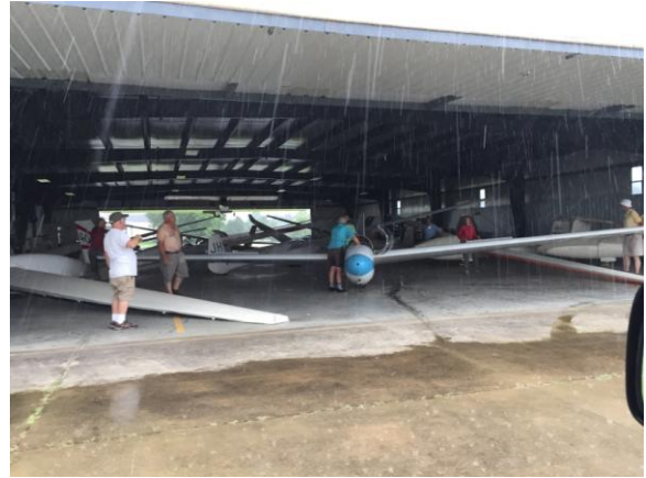
Creative hangar packing by the St. Louis Soaring Association—just before the rain fell!