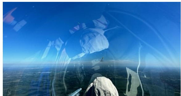
Doug Jacobs and Romey on task

My final day with Doug proved to be fruitful. The competition was on—a totally blue sky day with a challenging task. My job from the back seat was to be Doug's eyes to identify where others were thermalling and where the gaggles were and, if needed, to find a suitable landout, preferably an airport.