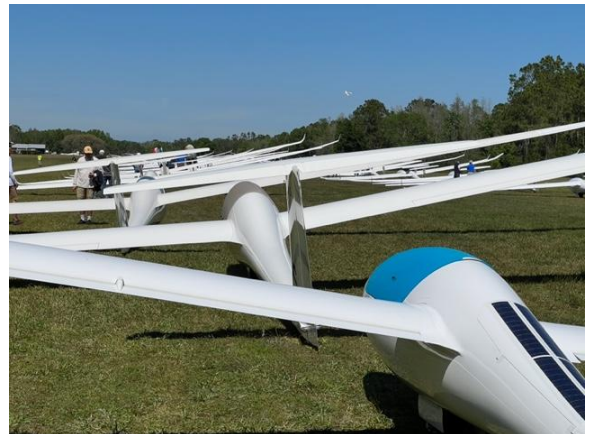
Another view of the Seniors grid