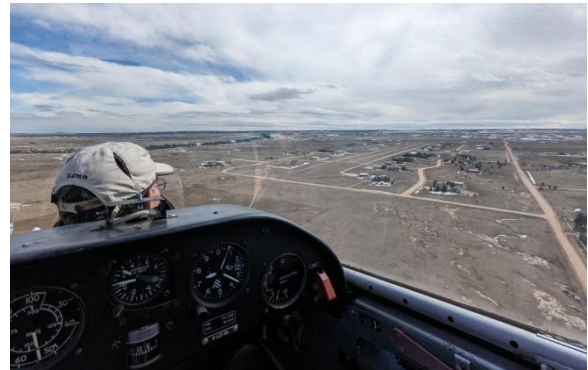
Stan Bissell prepares to turn final in 9BA.