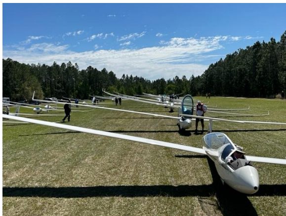
Launch Line at the Seniors