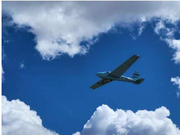
Becky Kinder launches in 1-26E, Blue Jay.

Becky Kinder – First flight in Blue Jay!