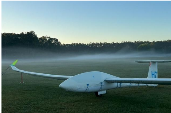
Sunrise at the Seniors.