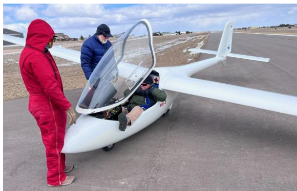
No Cockpit for Old Men The Editor struggles to get out of the PW-5 cockpit on a cold spring day.