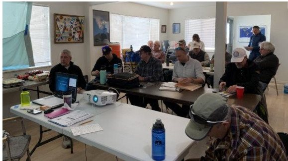
Bronze Badge Workshop

We had a very well attended Bronze Badge Workshop on March 11. We reviewed some performance calculations and spent lots of time discussing preflight planning and looking at airfields using Google Earth and the FAA's interactive map, among other tools. We even did some planning for a couple of Silver Distance routes. We all enjoyed a potluck lunch that gave us a good break in between sessions. WINGS credit was awarded to 20 members. Thank you all for devoting your Saturday to learning and preparation for the coming soaring season!