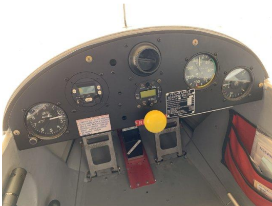
840 now has a transponder!