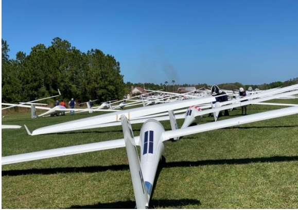
H7 on the launch line at the Seniors