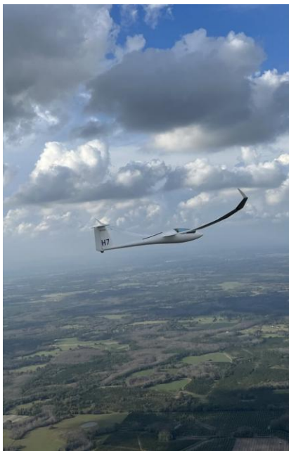
Bif in flight at the Seniors