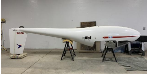
"I'm really getting tired of this," said 87E to no one in particular.