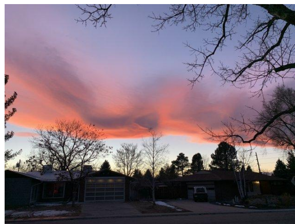
Evening lennies, 3/12/2022