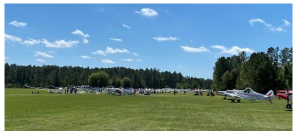
Busy pre-launch activity at the Seniors