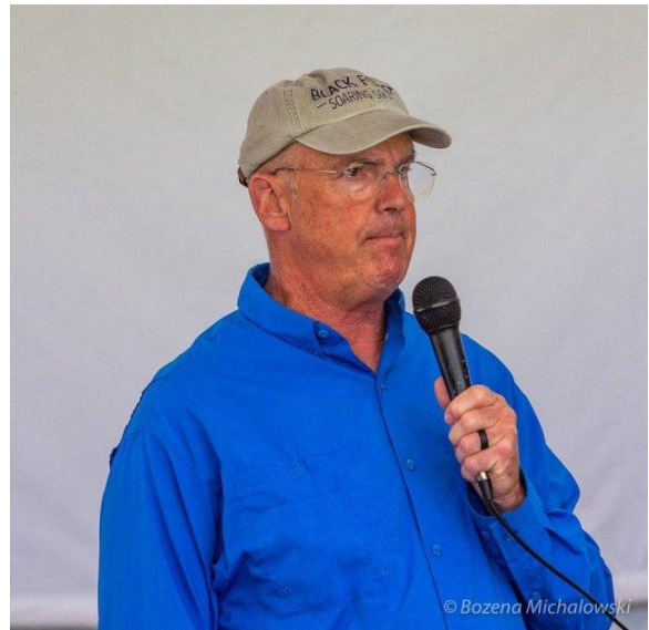
Bif describing his win on the first contest day of the Seniors