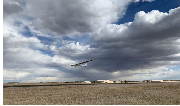
Vitaliy Aksyonov taking a late afternoon tow with Z3, with good lift still plentiful.