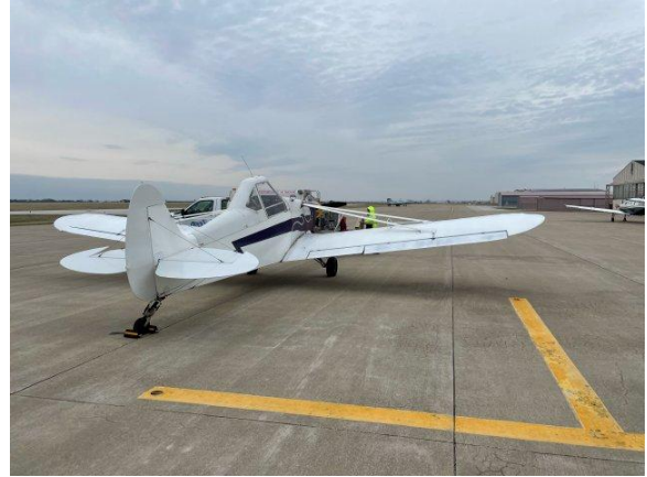
41Y at Quincy Regional Airport, 3/29/2022