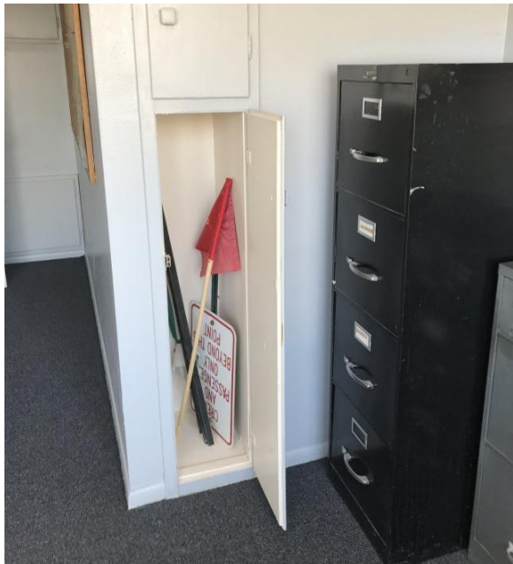
The ATC flag is now stored in the cabinet in the battery room.

Mike Kinder – Donated the new welcome mats