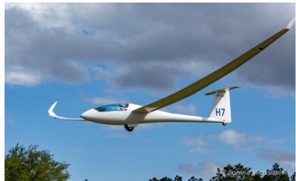
Bif landing at the Seniors