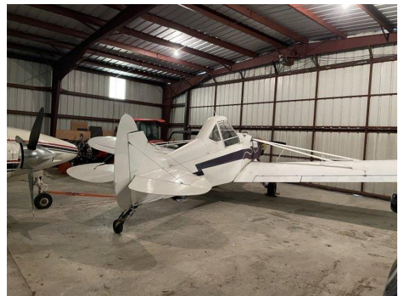
High winds and storms kept Al and 41Y an extra day in Concordia, KS. 3/30/2022

This is where the picture of 41Y arriving at KAP would be. Unfortunately, 41Y didn't make it home by press time. We'll have pictures and hopefully a story of 41Y and Al's adventure next month!