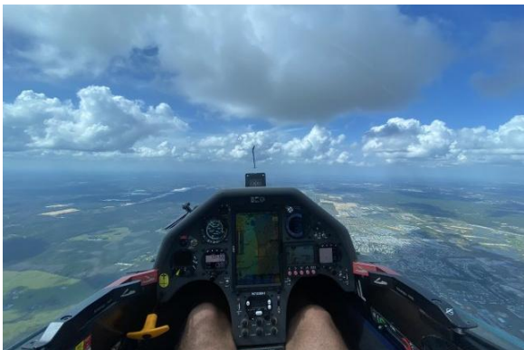
Nice day at the Seniors