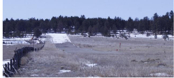
Aero Bear, Looking South

First, we took another look at Aero Bear , which is on the Denver Sectional. We reported on this one before. It looks landable, but has a steep rise on the far south end, uphill to the south. Keep in mind there are powerlines on the north side of the road that runs north of the runway.