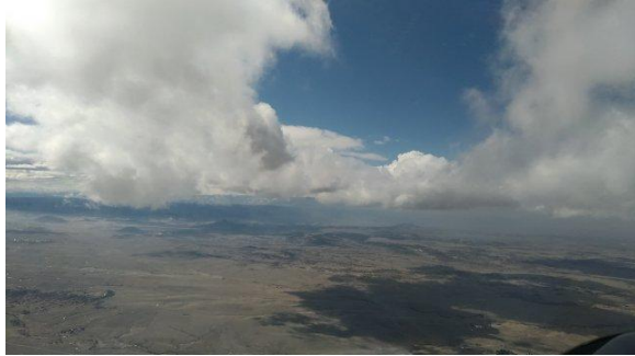
Just before the craziness. Vitaliy Aksyonov snapped this part of a convergence line. March 14, 2020