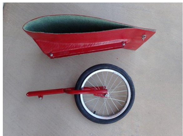
Acting on a hot tip, Raul Boerner picked up this sweet wing wheel set for the PW-5.