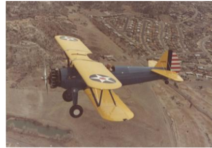
Harry's Beautiful Stearman

http://www.soarcsa.org/index.php?mact=News,cntnt01,detail,0&cntnt01articleid=222&cntnt01o rigid=51&cntnt01returnid=104