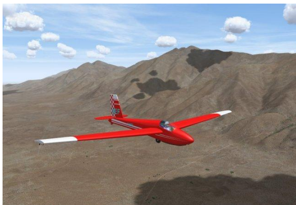
1-26 on Condor 2