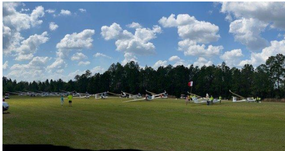
Bif took this picture of the flight line at the Seniors, March 13, 2020.