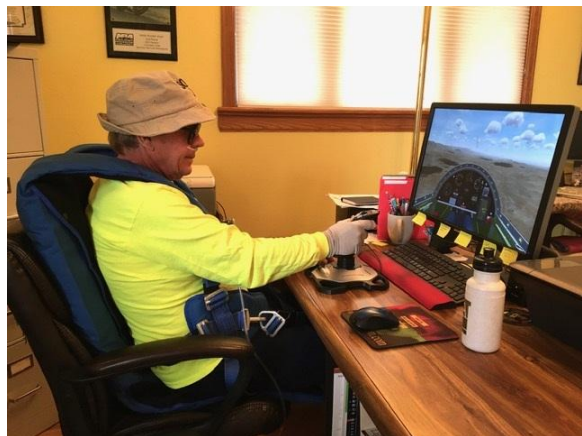
Staying Current During COVID-19