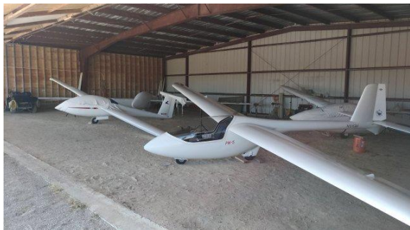
Where is everybody?