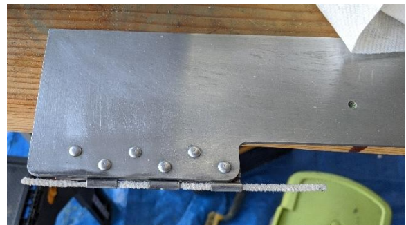
Clean and Shiny! Stripped Dive Brake