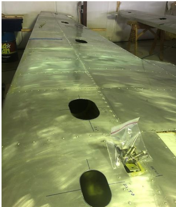
Inspection Holes Measured and Cut

Doug has begun to cut the additional inspection holes in the wings required by Schweizer for the upgrade. This requires his expertise in precise measuring and cutting.